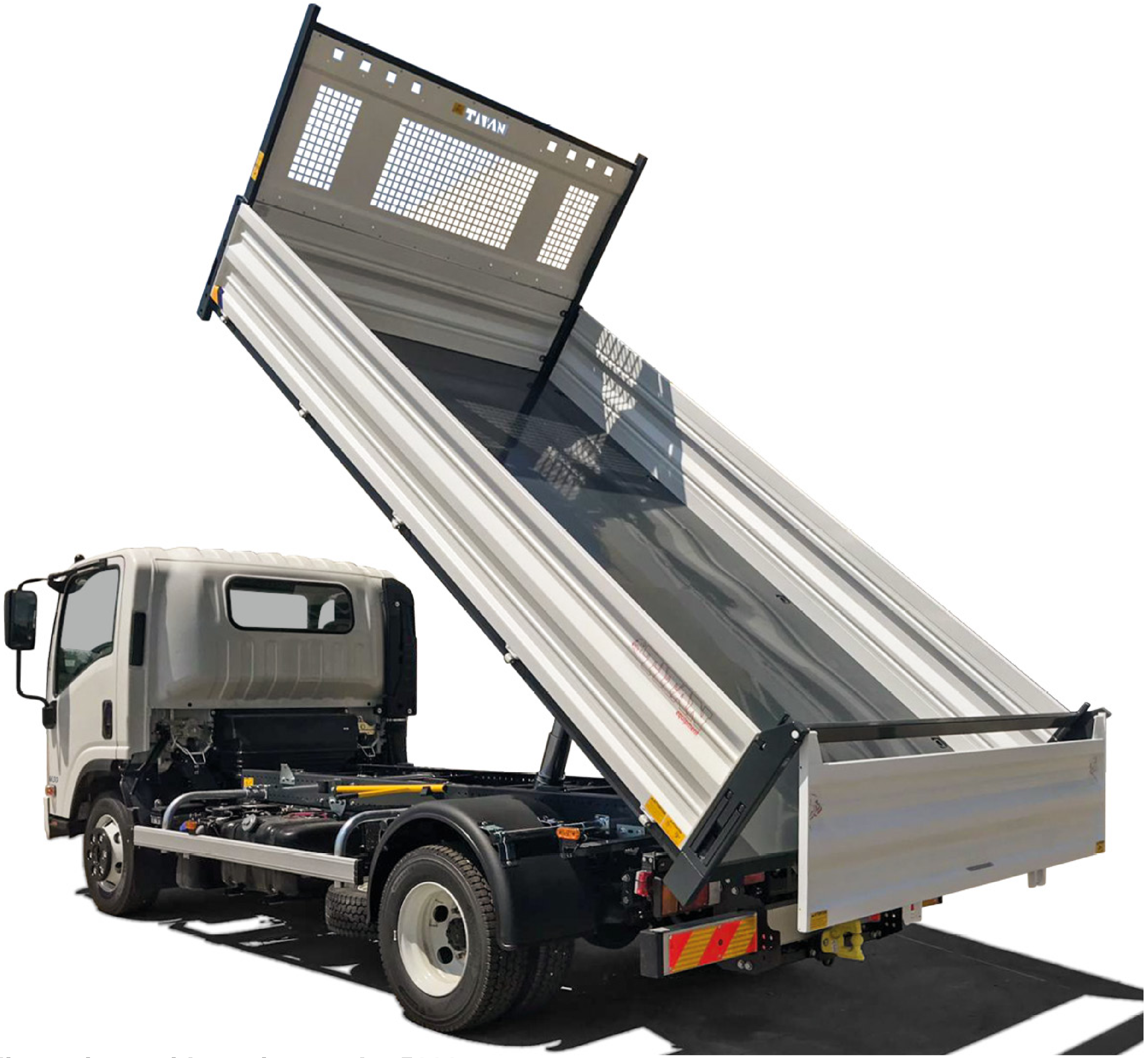
Overall dimensions with equipment L= 5620 mm